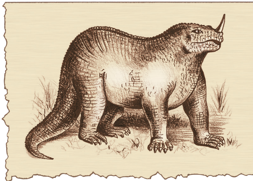
What Gideon Mantell thought an Iguanodon looked like

Gideon Mantell did not have a whole Iguanodon skeleton. But from the bones he had collected over the years, he tried to figure out what one might have looked like. He thought the bones showed that the creature had walked on all four legs. He thought a pointed bone was a horn. He drew an Iguanodon with a horn on its nose.