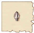
A life-sized drawing of an iguana's tooth from Gideon Mantell's notebook